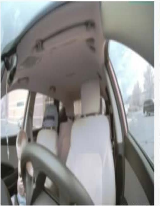
RETEST PRSS 0.000 05/26/2018 05:26:47 PM