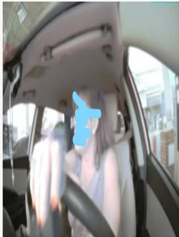
ENGINE ON 05/26/2018 05:34:42 PM