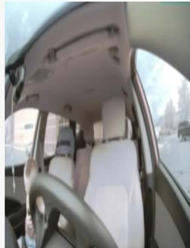
RETEST PASS 0.000 05/26/2018 05:26:47 PM